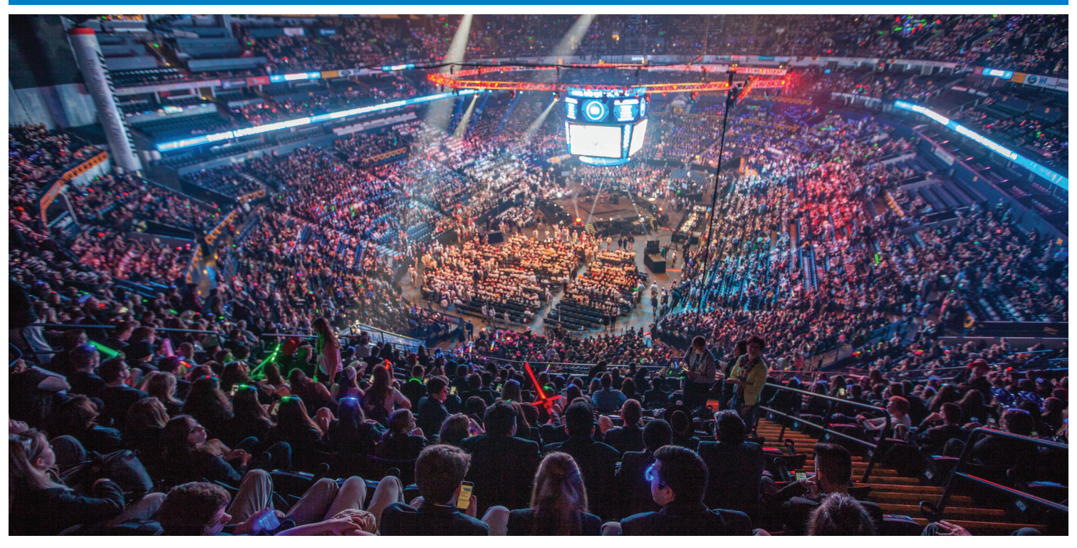
CHAPTER REGISTRATION KIT APRIL 26-29 | ANAHEIM